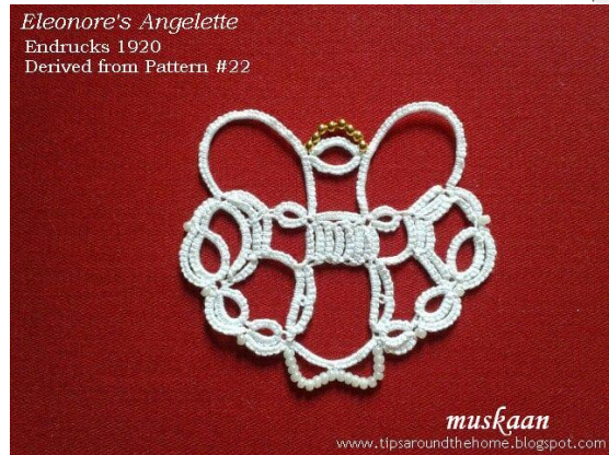
Small angel in one pass, with beads