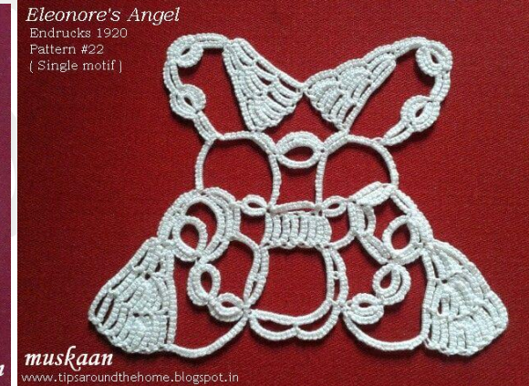
Single Motif in one pass