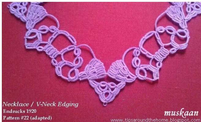
Idea for Necklace or broad V-neck collar