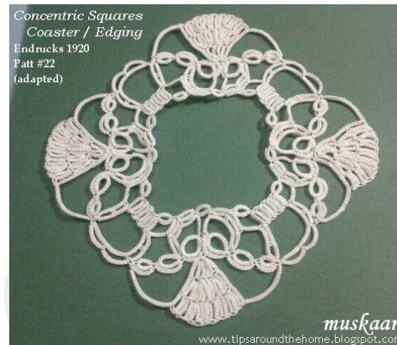
Broad edging for coasters, mats, etc. (one pass)