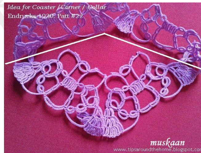
Idea for a square coaster or collar (can be done in one pass)