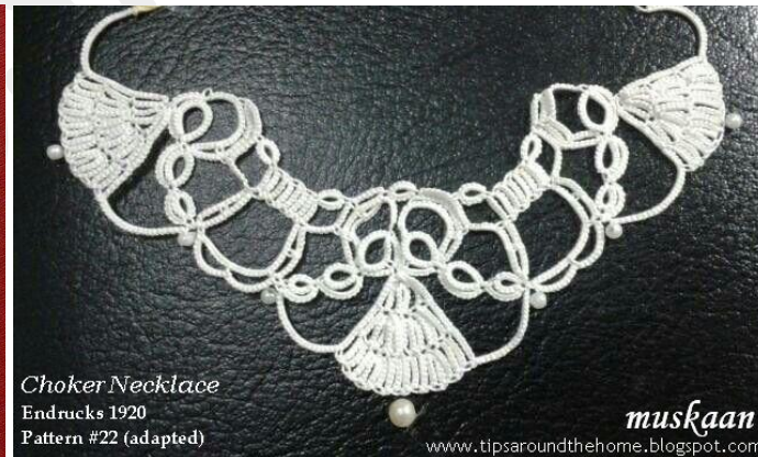
Idea for Choker necklace