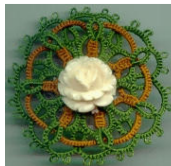
Green & gold was glued to a brooch finding The rose is "recycled" from an old bone earring

Remember if you hide the ends the motif becomes reversible. I cheated and just did a triple knot and cut close. Glue can be applied to the knot if desired.